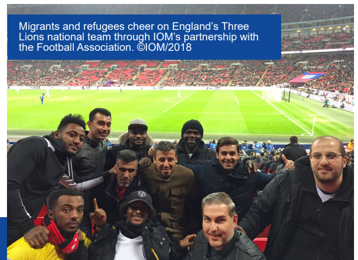
Migrants and refugees cheer on England's Three Lions national team through IOM's partnership with the Football Association.

International Organization for Migration (IOM) in the United Kingdom