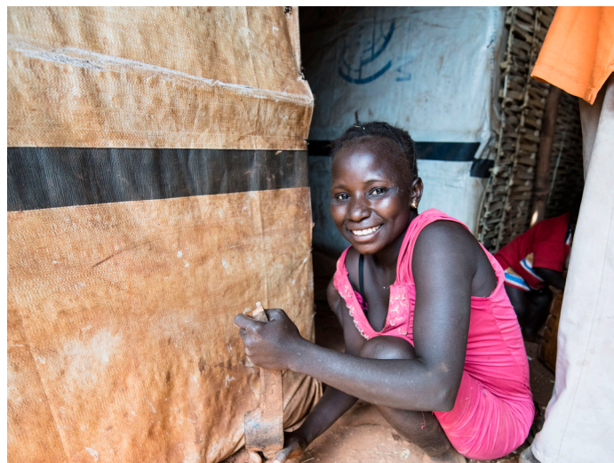
As the 5th largest donor globally, UK funding contributes to IOM's shelter programmes in South Sudan.

With nearly 400 offices around the world and 11,000 staff, IOM promotes international cooperation and dialogue on migration issues to assist in the search for practical solutions to key issues facing migrants and societies alike.