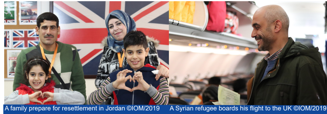
A family prepare for resettlement in Jordan ©IOM/2019 A Syrian refugee boards his flight to the UK ©IOM/2019

With nearly 400 offices around the world and 11,000 staff, IOM promotes international cooperation and dialogue on migration issues to assist in the search for practical solutions to key issues facing migrants and societies alike.